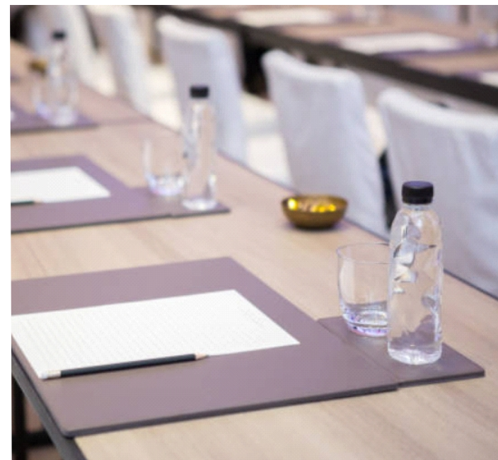
OCEAN WAVE MEETING ROOM