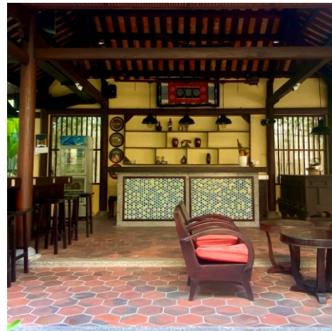
THE SAILOR BAR